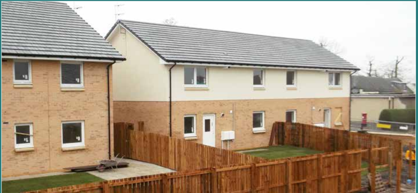
Cultenhove, St Ninians