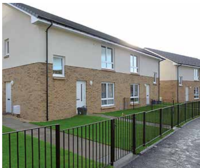
Adamson Place, Cornton

to meet the needs of current and former Dunblane residents who find themselves in housing need due to medical, mobility or other special circumstances. Work should start in early 2016.