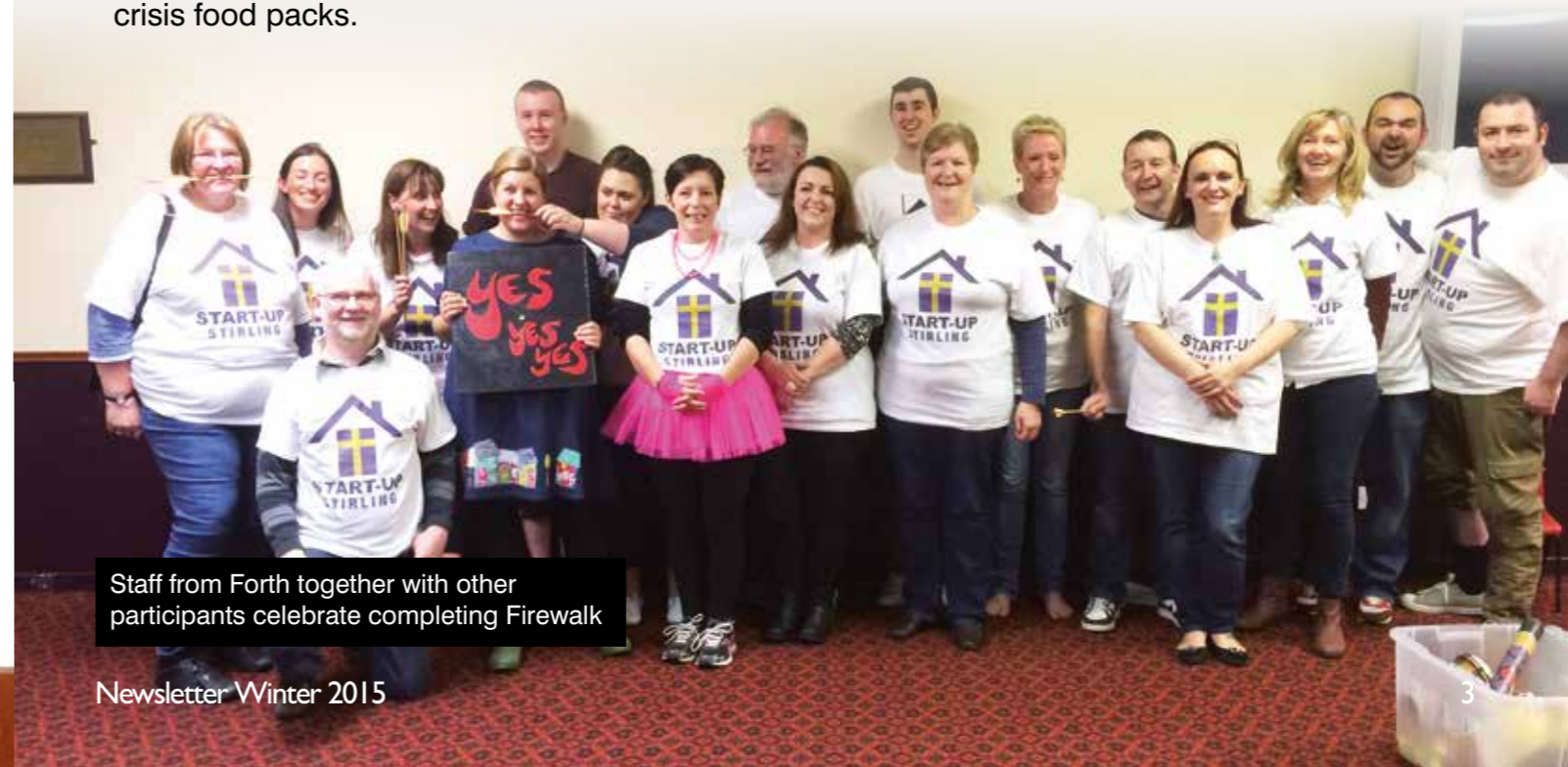
Staff from Forth together with other participants celebrate completing Firewalk

To donate to Start-up Stirling log on to: www.start-upstirling.org.uk