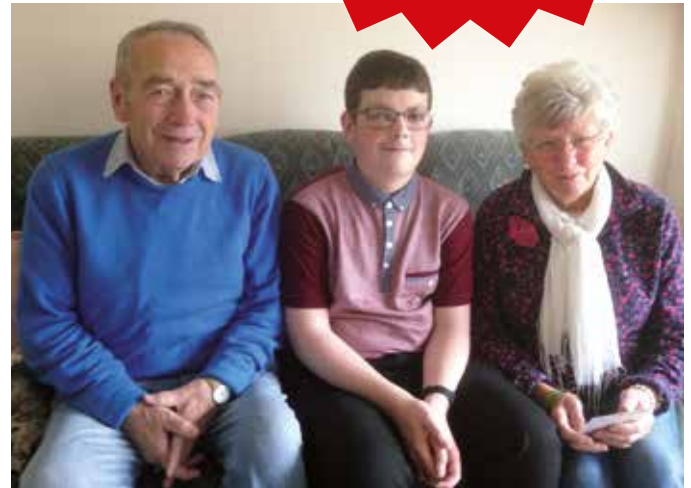
Our 2015 winners

To nominate your neighbour, who requires to