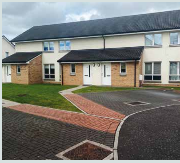
Archie Bone Way, Fallin.

Estate management, including landscaping and close cleaning is closely monitored by our housing services staff and we pride ourselves in the way that our estates look and are maintained.