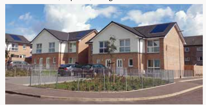
Earlsburn Avenue, Cultenhove.